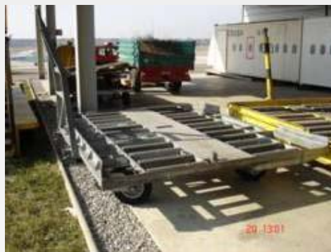
10 feet dolly/ 20 feet dolly