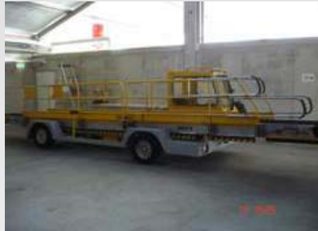
Conveyor belt/ Förderband