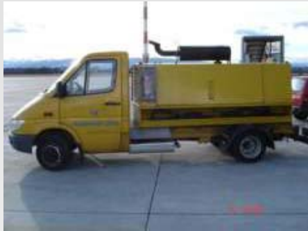
Ground Power Unit Bodenstromversorgungsgerät